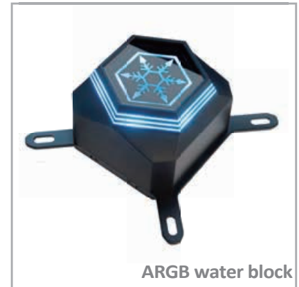
ARGB water block