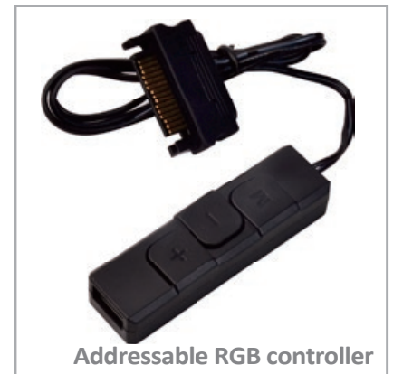
Addressable RGB controller