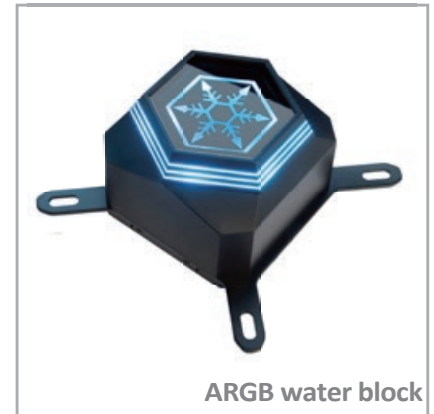
ARGB water block