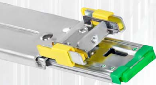
Design ad incastro