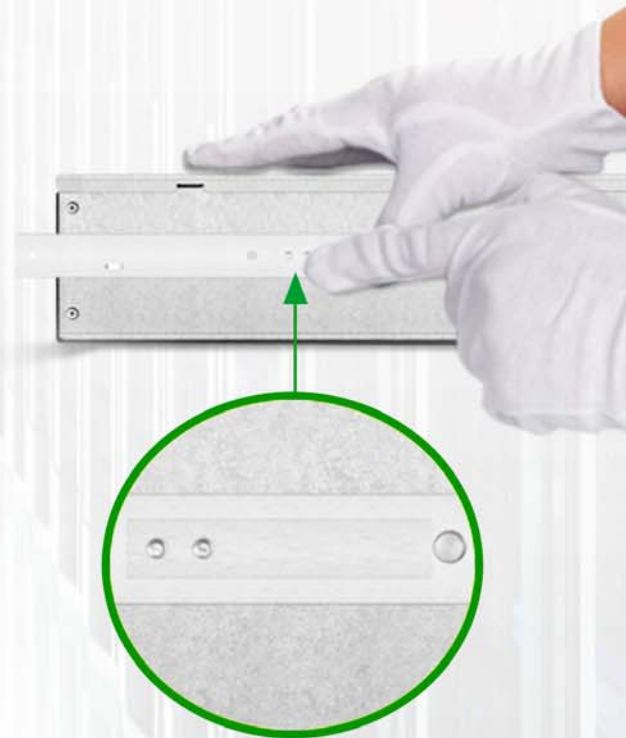
clip a molla