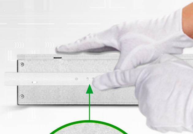
clip a molla